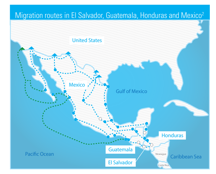
Note: This map is stylized and it is not to scale. It does not reflect a position by UNICEF on the legal status of any country or territory or the delimitation of any frontiers.

In Mexico, the Migrant Protection Protocols have led to an increase in the number of migrant children stranded in border areas, such as Matamoros, Tijuana, Reynosa, and Ciudad Juarez, while they wait for their asylum cases to move through the U.S. court system – a process which can take months. In many of these areas, migrant children and their families face exploitation, violence and abuse and lack access to essential services.